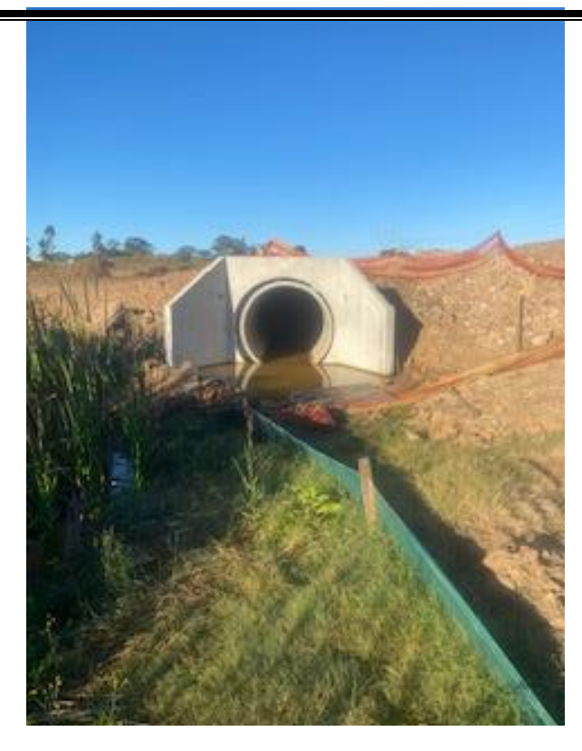
9th (current 11th) Dip

As you can see here is one of the major pipes that now come into our dam on the side of the new 13<sup>th</sup> fairway (location-the Old 16<sup>th</sup> green for those that can remember). This 1.8m pipe is now completed and will channel water straight Into the dam and bypass the 13<sup>th</sup> and 14<sup>th</sup> holes, allowing them not to take as much water as they once did. This water is also coming from across at the crest.