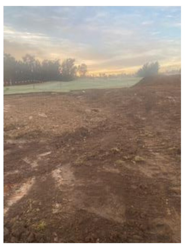
The 9<sup>th</sup> front tee is getting shaped at the moment and should have turf within a week. This area will become a construction zone soon to enable us to finish the back tees on the 9<sup>th</sup> and also get major infrastructure for the cart crossing and road crossings.