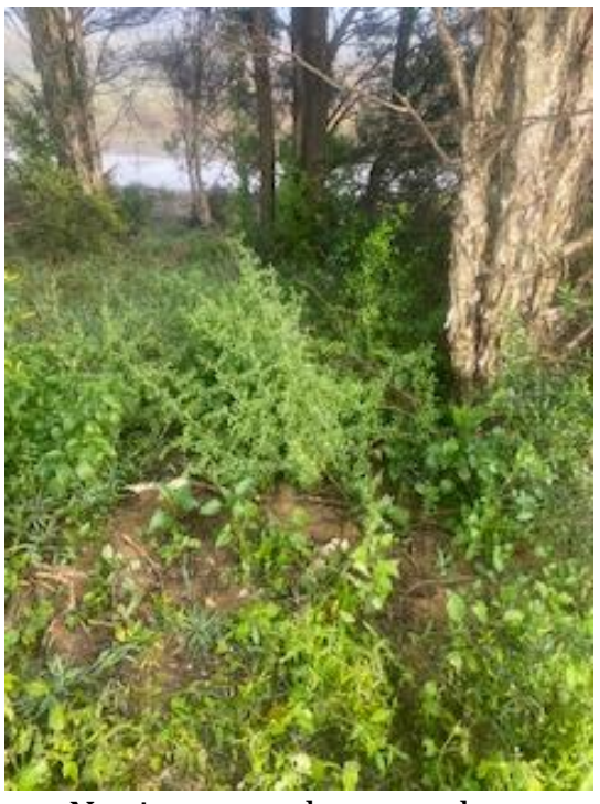
Noxious weed removal

For those that can remember, the trees that we were driving through to get to the old 8<sup>th</sup> tees from the old 5<sup>th</sup> green have been cleared and cleaned out. Noxious Boxthorn and African black olive as well as Privet was removed. We think the area is more player friendly now.