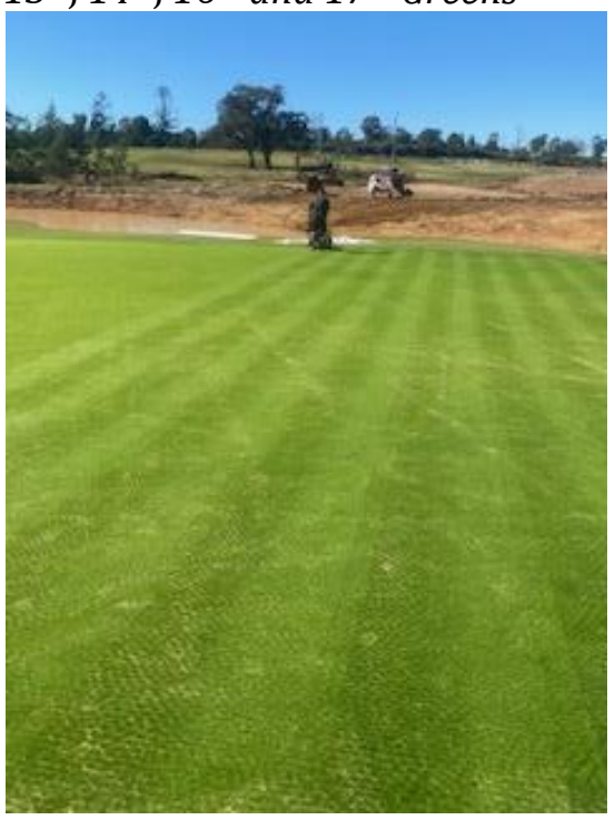
First cut on 16th green