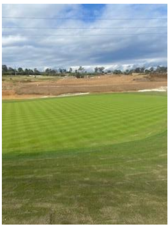
Multiple cuts and weeks later

The 16<sup>th</sup> and 17<sup>th</sup> greens are encouraged weekly with stimulants to improve growth at this time of year. Plugging of areas to get the green fully covered is also ongoing. Covers are put on if temperatures will produce frosts. Fungicide programs are high as covers produce micro climates for fungi to develop. Both greens are currently at 4mm in height.